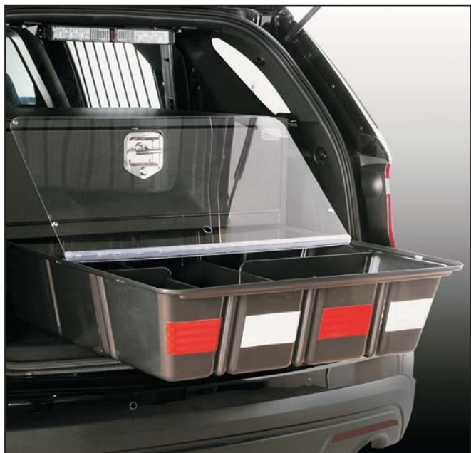
TufBox Storage Bin - 36-100 $349.95