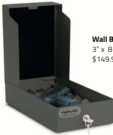
Wall Box - 73-601 3" x 8-1/8" x 14-1/8" $149.95 Key lock cylinder

Contact Customer Service for guns not listed.