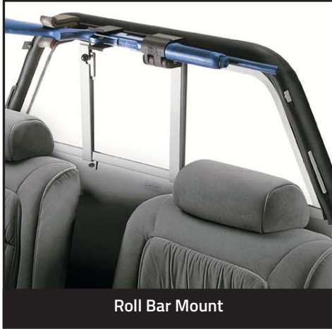
Roll Bar Mount