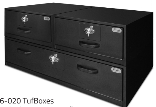
36-020 TufBoxes stacked on 36-009 Tufbox

Note: TufBox Bases, Accessories and Bin sold separately.