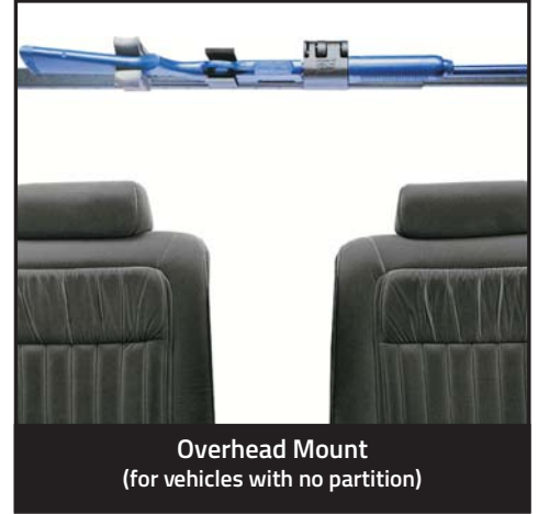
Overhead Mount (for vehicles with no partition)