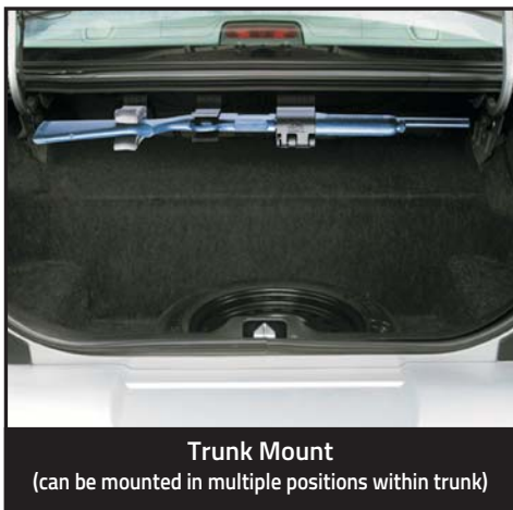
Trunk Mount (can be mounted in multiple positions within trunk)