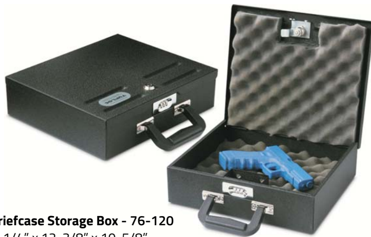
Briefcase Storage Box - 76-120 3-1/4" x 12-3/8" x 10-5/8" $219.95 Combination lock with key override