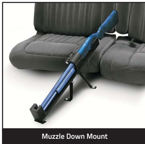
Muzzle Down Mount