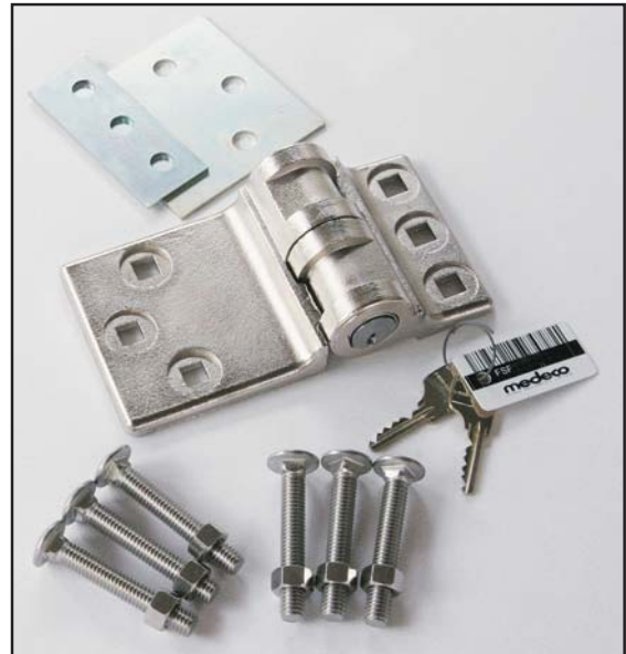
Kit includes two keys, back plates and carriage bolts